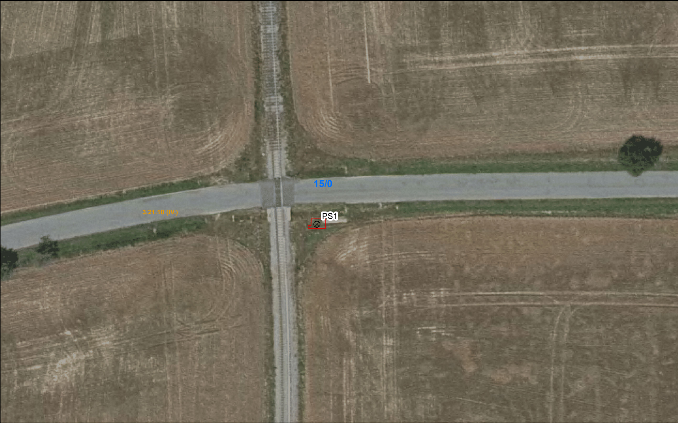
Příloha 3: Mapa skrývkové oblasti